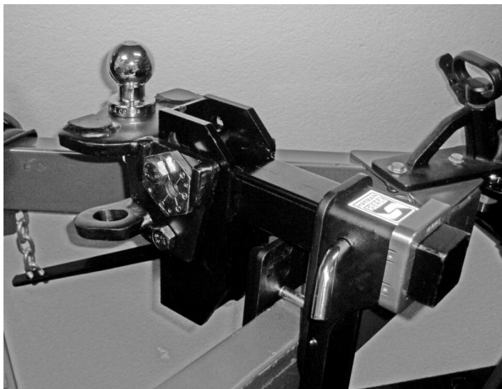
Figure 2 - Weight Distribution Holder

Note: 150mm drop shank to mount in reverse direction to Figure 2.